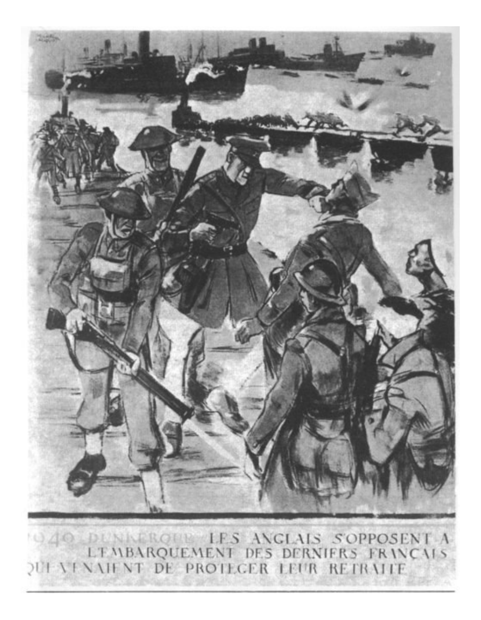
Fig.1. A Vichy French propaganda showing British soldiers preventing French poliu from escaping onto the ships at Dunkirk at bayonet point. A company of the 5th Green Howards performed this duty in the last days of the evacuation. (Reproduced in W. Lord, The Miracle of Dunkirk , (London, 1983) from the Musée des Deux Guerres Mondiales – BDIC, Universités de Paris )