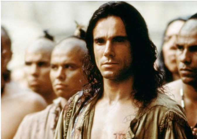
Britain's Daniel Day Lewis is a Jew.