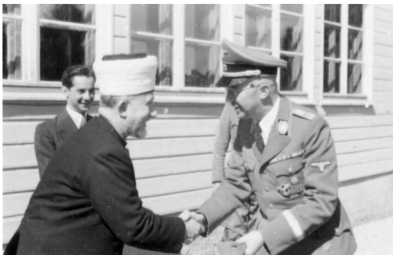
A delighted Haj Amin meets the head of Hitler's SS. Haj Amin helped recruit 20,000 Muslim volunteers for the SS.

The British did numerous other anti-Zionist things during their years in Palestine. The webpage tinyurl.com/bmandate gives many instances. Some of these were so extreme, particularly during WWII and the years following it, as to explain why certain Jews were ultimately prepared to use violence against the British Administration. (In this regard, I think it only fair to note that, throughout the 1920s and 1930s, the response of the Jews to the torture, rape and murder of their number by Muslims was very restrained. Indiscriminate reprisals, for example, were almost unheard of right up until the late '30s, and even then they were limited to a tiny band of individuals disowned by the Jewish community at large.)