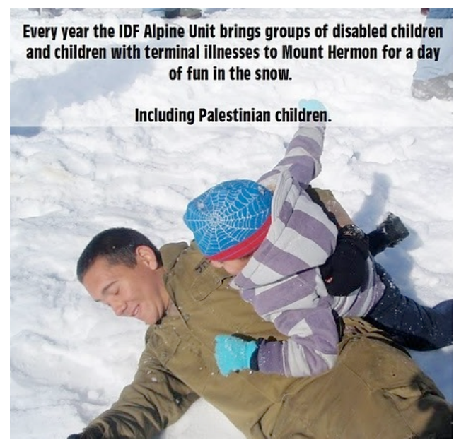
It seems strange that the western media (if it is pro-Israel) doesn't trumpet such acts.

During fights with Israel, members of the Hamas leadership sometimes direct their military operations from civilian hospitals so as to be able to function in safety. There is also little doubt that Hamas, "hijacks international medical aid intended for the Gazan masses, diverting it to special locations where its gunmen are being treated". By keeping its wounded out of sight, Hamas makes it appear – to any reporters at normal hospitals – that only civilians are being hurt. And by using human shields, e.g. by placing rocket launchers in built-up areas, Hamas pretty much guarantees civilian casualties. These tactics naturally help damage Israel's reputation. Why doesn't the western media do a better job of telling us these things, if it is as pro-Israel as some people say?