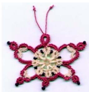
Butterfly worked in no. 20 thread on button