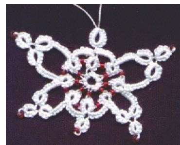
Butterfly worked in new Finca Bolillos no. 20 thread on SCMR

The first butterfly is made on a button and the other is almost the same but replacing the button with a Self Closing Mock Ring. The second one has more beads. They can both be made using one or two colours which means a slight variation for the last ring worked.