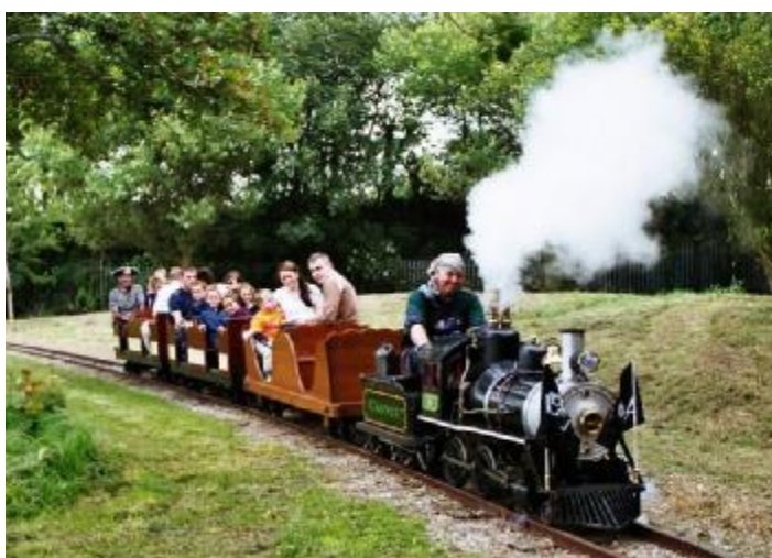
Both steam trains were in action all weekend, Joan being renamed Blackbeard. The railway volunteers all enjoyed themselves, many also dressed up in pirate costumes.