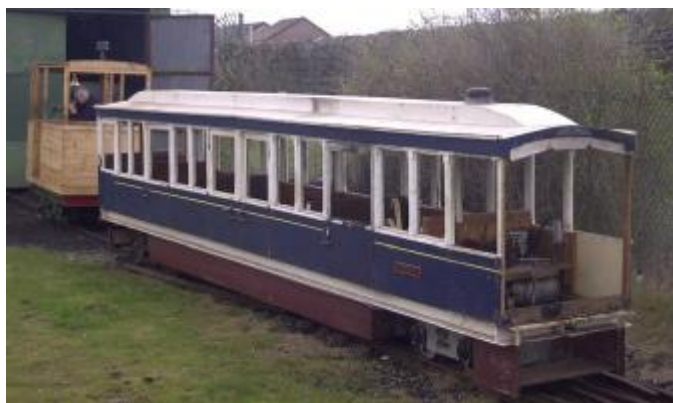
The new coach at Rhyl on 23 rd October. It can also operate independently as a battery powered railcar.

Our enclosed saloon coach was delivered from the Windmill Farm Railway on October 19 th . It may be possible to restore it in time for use during next summer's gala weekend.